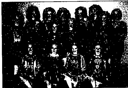
PLEASE SEE IRISH , B2 Dancers from the O'Hare School kick up their heels at the Hellenic Cultural Center