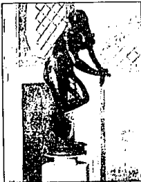
Glennabologna bronze sculpture of Venus originally topped Tribolo's fountain of The Labyrinth at the Medici Villa. It can be found in the Garden Gallery along with a larger-than-life sculpture of Hercules.