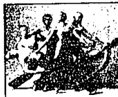
Alvin Ailey American Dance Theater performs through Sunday, March 16 at the Detroit Opera House.

What: Alvin Ailey American Dance Theater. When: 8 p.m. Thursday-Saturday, March 13-15; and 2 p.m. Saturday-Sunday, March 15-16. Where: Detroit Opera House, 1526 Broadway, Detroit. Tickets: $18-$86, call (313) 237-SING or (248) 645-6666. Tickets can be purchased on the Internet at www.MichiganOpera.org . Family performance: Buy up to four child tickets at half price with the purchase of one adult admission, 2 p.m. Saturday, March 15.