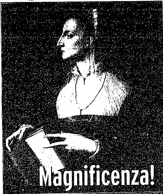
Agnolo Bronzino painted this portrait of poet Laura Battiferra. Her "iron and ice" exterior can not be softened even by the delicate transparent veil and ruffled collar.

The Sons of the Desert, a metro Detroit area Laurel and Hardy fan club, meets 6-8 p.m. Thursday, March 20, at Mama Mia's restaurant, 27770 Plymouth Road, Livonia. The club has been showing Laurel and Hardy films for more than 65 years. For more information, call (734) 955-2407 or e-mail lorial@aol.com .