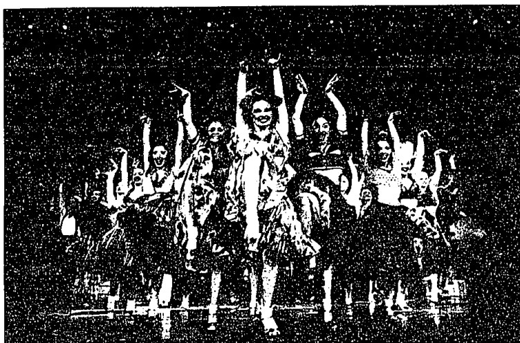
Swing is among the numerous ballroom and Latin dance styles performed in 'Burn the Floor'.

Can an orchestra really sound like Cinderella's clock striking midnight; depict a beautiful firebird saving a young man from evil monsters; or evoke scurrying rats following a piper through the streets of Hamelin? When they're playing music written by world-famous composers, it can. Audiences will hear works inspired by fairy tale favorites written by Mendelssohn, Prokofiev, Stravinsky and more at 4 p.m. Sunday, March 23, at the Michigan Theatre in downtown Ann Arbor. The hour-long concert by the Ann Arbor Symphony Orchestra is preceded by an "Instrument Petting Zoo." Recommended for children ages 5-8, and all ticketholders are welcome. Admission is $10 adults, $5 children. Call (734) 994-4801 or online at www.a2so.com .