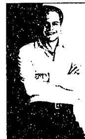
Harry Wayne Casey is known to fans as KC.