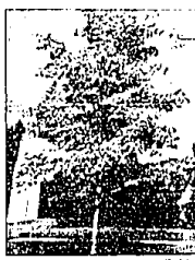
Beautiful, healthy trees are important for the landscape and environment.

Among the local participants are: Auburn Oaks Nursery in Rochester Hills; C.G. Wilkop Landscaping and Garden Center, Telly's Greenhouse and Garden Center, and Uncle Lake's Feed Store in Troy. Four Seasons Garden Center in Oak