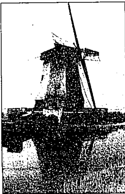
Windmills are part of the Dutch landscape and history. Kinderdijk has 19 windmills, including this one. Most were built around 1740.