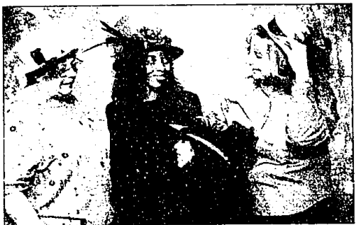
Celebrate "Spring in America" April 1-27, at Henry Ford Museum, 20900 Oakwood Blvd., Dearborn. Try on hats in the historic hat display, let your child create a paper hat, or try kick up your heels with English country dancing. Hours are 9 a.m. to 5 p.m. Monday-Saturday, noon to 5 p.m. Sunday. Tickets are $8.50-$13.50. Call (313) 271-1570.

Rochester Hills Museum at Van Hoesen Farm The 16-acre museum complex tells the story of Oakland County's earliest pioneers. Admission includes tours of the 1840 Van Hoesen Farmhouse, 1850 Tenant Red House and 1927 Van Hoesen Dairy Barn. The museum's new permanent exhibit, A Lively Town, uses more than 200 images and 100 artifacts to show the development of the Rochester area. $5. $3 children, students and seniors. Hours are 1-4 p.m. Wednesday-Saturday, at the museum on Van Hoesen Road, one mile east of Rochester Road off Tenken. (248) 645-4663 or visit www.rochesterhills.org/museum.htm