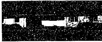
This photo was taken by Roland Hardy before the remodeling was completed.

For more information, contact OurPet's at (800) 565-2695, or visit www.ourpets.com .