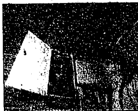
Jim Struble of RCI Electric retrofitted his home in Farmington Hills with wiring for the digital age.

The key components of a structured wiring system include a hub distribution center - similar in appearance to a traditional circuit breaker box - usually