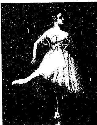
'L'Air d'Esprit' is a tribute to Russian ballerina Olga Spessivtzeva. The pas de deux is performed in Encore , Arpino.