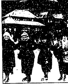
Girls ice skate on Belle Isle.