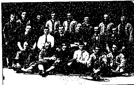
Members of the Detroit Athletic Club are pictured in this historic photograph.