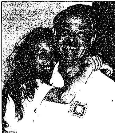
This picture was taken last October one week before my father had emergency open heart surgery for six by-passes. He's doing great now, and Father's Day is special to me this year.