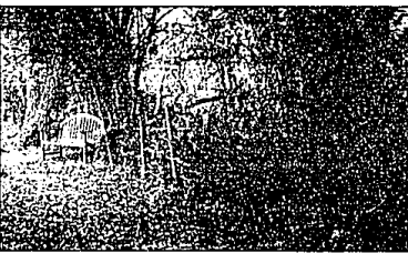
Trimmed branches form an attractive "twig wall," held in place by cedar posts.

Wildlife on the site includes deer, chipmunks ("by the hundreds," Jim said), blue heron that perch on almost any tree