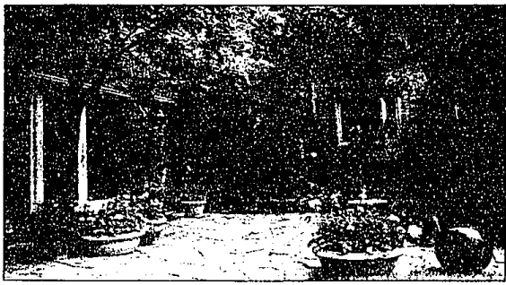
The patio is a good place for barbecues and garden parties.

where the McCooks' grandchildren look for leprechauns on St. Patrick's Day (and find treats), and a "good witches' circle" where the youngsters have peanut butter sandwiches.