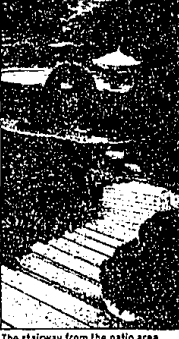
The stairway from the patio area leads down to the swimming pool.