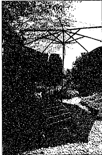
Someone can sit in the shade here and sip lemonade.

jabramczyk@oe.hometourlife.com (248) 951-207