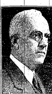
WEBSTER H. PEARCE Supt. of Public Instruction