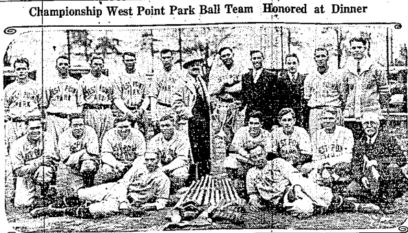
Above is a picture of the West Point Park baseball team which won the Inter-County League championship this year and defeated River Rouge, champions of the Down-River League, in an inter-league series.