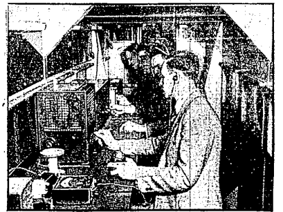
Showing One of the Two Laboratory Benches With Which the Plane is Equipped.

A FORD tri-motor all-metal monoplane of a type having a rated capacity of fourteen persons has been added to the facilities of the Bell Telephone Laboratories in New York City. This is the largest and most complete flying radio laboratory in the world and its purchase by the Bell Laboratories follows its established policy of making pioneer studies in all phases of electrical communication.