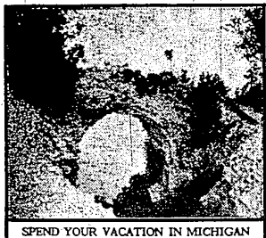
SPEND YOUR VACATION IN MICHIGAN