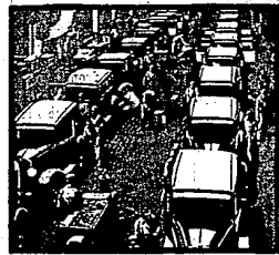
Modern production methods assure high quality

50-horsepower six-cylinder motor... full-length frame... four semi-elliptic springs... fully-enclosed four-wheel brakes... four Lovejoy hydraulic shock absorbers... dash gasoline gauge... Fisher hardwood-and-steel body... adjustable driver's seat... non-glare VV windshield... and, for your protection, a new and liberal service policy.