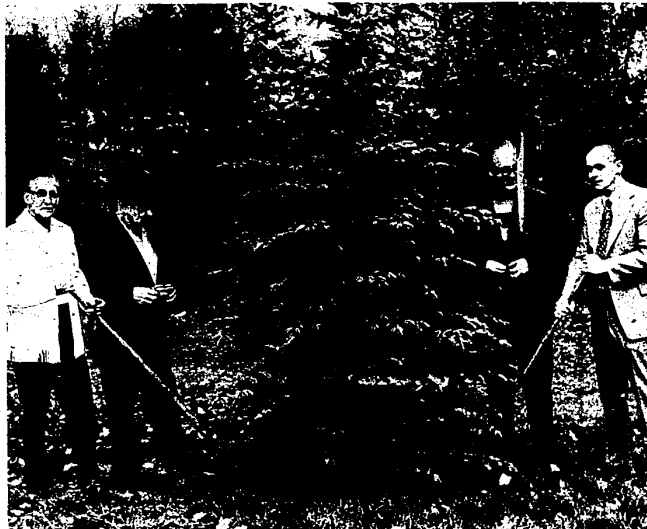
TREE TO CENTER -- The Farmington Kiwanis Club, which meets each Tuesday evening in the Treasure House, has donated and planted a full-grown evergreen tree to the Farmington