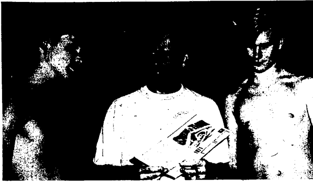
SWIM-A-THON -- Funds for the Farmington High swimming programs will be raised with a Swim-a-thon to be held Friday, Nov. 12.