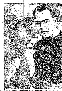
CLIFF EDWARDS and WILLIAM HAINES in "FAST LIFE"

As a distinct departure from enervating "drawing room drama," the lightning fast motorboat thriller, "Fast Life," is offered on the Great Lakes screen for Sunday and Monday with an exceptionally strong cast headed by William Haines and Madge Evans.