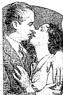
Lya Lys and Lee Tracy in "Clear All Wires."