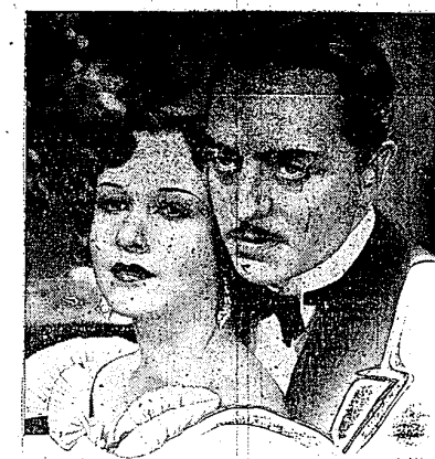
Margaret, the son of William Powell in "Private Detective 62" Theatre Sunday and Monday.

Kiddies, try our new fresh CREAM-O- BITES, 2 for 5 cents