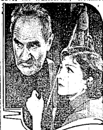
Claudette Colbert and Ernest Torrence in "I Cover the Waterfront"

Screen actors have found themselves in many strange situations during the filming of thousands of pictures in Hollywood's history, but no assignment was so bizarre as the experience of a group of Chinese atmosphere players in "I Cover the Waterfront," Reliance's