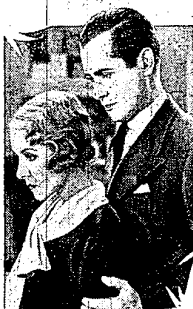
ROBERT MONTGOMERY and HELEN HAYES in "ANOTHER LANGUAGE"

Young married couples who find themselves smothered by in-laws will have sympathy for the characters played by Helen Hayes and Robert Montgomery in "Another Language," which plays Sunday, Monday and Tuesday at the Great Lakes Theatre. In the Metro-Goldwyn feature, filmed from the famous Rose Franken stage hit, the "heavy" is the hus-