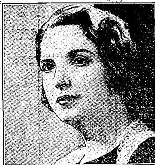
MISS AILEEN SPAFFORD, well-known authority on home-making, whose articles are a feature of the Women's Pages of the Detroit Free Press.