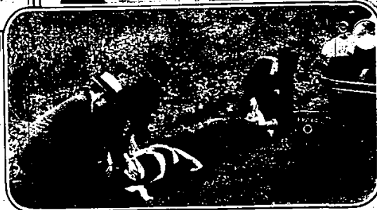
Red Cross first aid on the highway.

The Red Cross has given relief to those in need because of unemployment, disaster, and other causes, in every State, in practically every county, of the United States the past year.