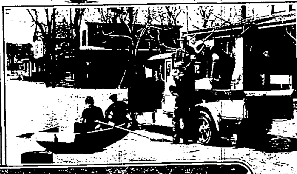
Red Cross volunteers carry food to homes inundated by Ohio river.