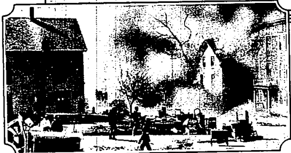
Red Cross aids homeless after destructive fires in Maine.