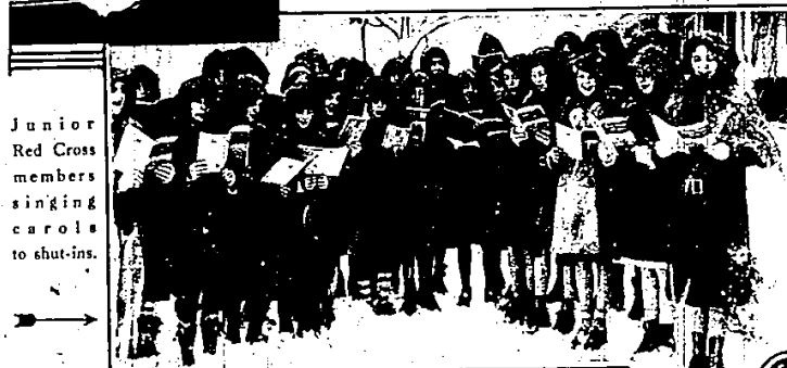
Junior Red Cross members singing carols to shut-ins.

Their home destroyed by a tornado, this Alabama family turns to Red Cross.