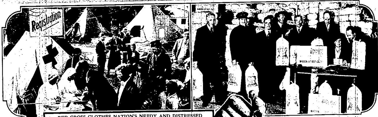
RED CROSS CLOTHES NATION'S NEEDY AND DISTRESSED

66,000,000 ready-made garments, including sweaters, provided.