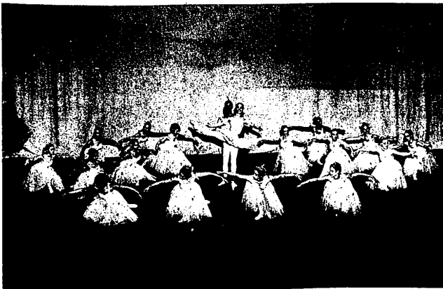
THE LOVELY BALLET, "The Nutcracker" will be presented Saturday, Dec. 11, at 8 p.m., in Plymouth High School Auditorium Joy Road, west of Canton Center Road. "The Nutcracker"

is being presented by the Severo Ballet Company, with music by the Plymouth Symphony. Tickets are on sale at Melody House, 770 Penman, and at the box office.