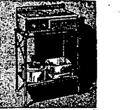
The "Kitchen Compact" comes complete with stand and cooking manuals shown here.

It's hard to believe that this compact little cooking appliance will really do so much. Small enough to tuck away in a corner, it will still perform all the cooking operations possible on a small electric range. Plug it into any electric outlet, and it is ready for practically any cooking task. It will broil, boil, roast, fry, toast, steam and bake. The drawer is a combined broiling and baking section, as well as a toaster. The square and round top elements answer virtually all general cooking needs. The square element may also be used for toasting. If you live in a small home, light housekeeping rooms, or kitchenette apartment, or if you have a summer cottage, here is just the cooking device you need. With this handy appliance, you can cook a dinner for 4 persons all at one time—a roast, two vegetables, potatoes and gravy, and dessert. The model shown above is finished in attractive light green vitreous enamel, with black trim. See it at your nearest Detroit Edison office.