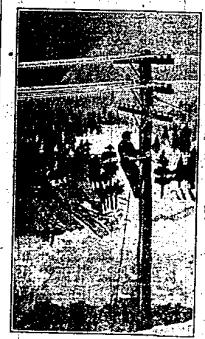
This telephone man has the wily assignment of repairing lines in the Crawford Hotel, one of the most scenic spots in the White Mountains of New Hampshire.