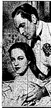
"Death takes a holiday" starring Frederic March and Evelyn Venable.

The Rotary Club There is nothing secret about Rotary. Its constitution and by-laws can be obtained by anyone. Its aims and objects are to encourage and foster the ideal of service as the basis of all worthy enterprise; high ethical standards in business and professions; the application of the ideal of service by every Rotarian to his personal, business and community life; the development of acquaintance as an opportunity for service; the recognition of the worthiness of all useful occupations and the dignifying of each Rotarian of his occupation as an opportunity to serve society; the advancement of understanding, good-will, and international peace through a world fellowship of business and professional men united in the ideal of service.