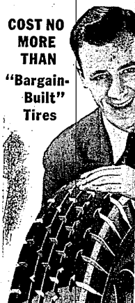
Goodrich Cavalier $5.70 and up

COST NO MORE THAN "Bargain- Built" Tires