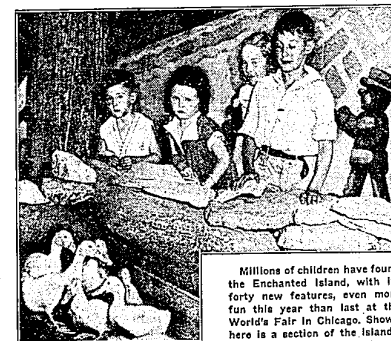
Millions of children have found the Enchanted Island, with its forty new features, even more fun this year than last at the World's Fair in Chicago. Shown here is a section of the Island's Adventure Land. Low travel rates and well-marked highways make Fair travel easy this year.