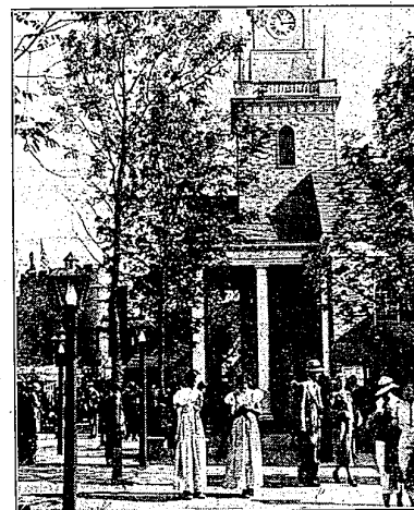
Colonial maidens, walking in the shadow of Old North Church, are one of the many quaint pictures that may be seen by the visitor to the Colonial village of the new World's Fair in Chicago.