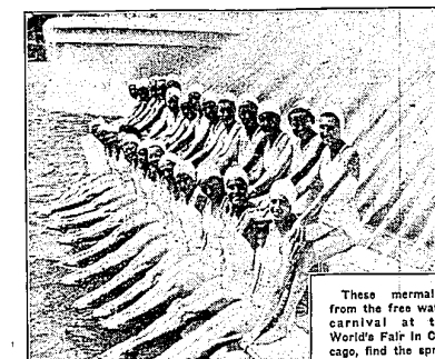
These mermaids, from the free water carnival at the World's Fair in Chicago, find the spray of the world's largest fountain, in the Fair lagoon, deliciously cool and great fun.