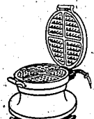
Electric Waffle Irons $4.95 up

Always an acceptable Christmas gift, the newest electric toasters come in dozens of attractive styles and models, many with the automatic feature that removes the last bit of effort from toast-making.