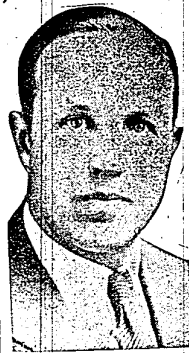
MURRAY D. VAN WAGONER State Highway Commissioner

I, therefore, say to my friends, party leaders, and other well-wishers that I am not, nor will I permit myself to be, a candidate for the Democratic nomination for governor. This action is final and without qualification.