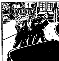
At One O'clock They Carried Wilbur Out to My Car.

Phylla yawned and rested an elbow on her desk, cupping her chin