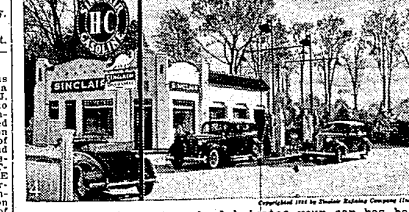
.. The Sinclair dealer who lubricates your car has behind him the experience of America's foremost company in the field of lubrication. Sinclair does a more thorough job of charting automobile lubrication than any other oil company.