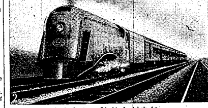
.. The Twentieth Century Limited which is . . .