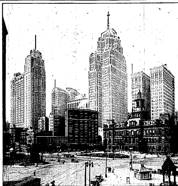
Skyscraper tower above the City Hall in the heart of modern Detroit