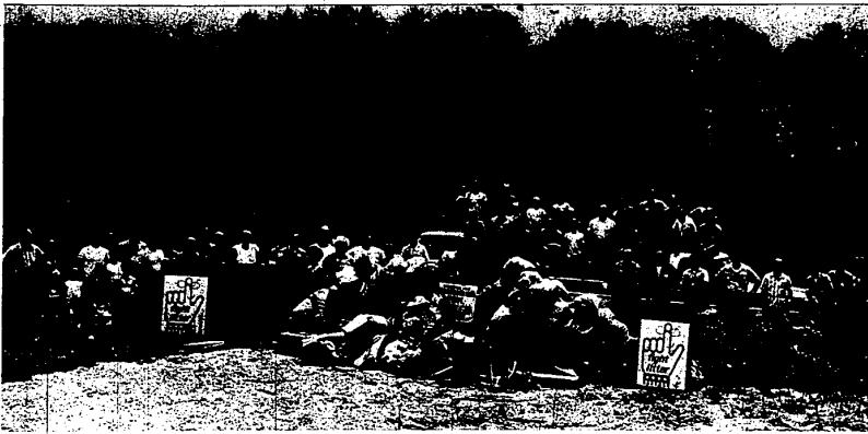
THE 75 PERSONS who picked up litter along N. Territorial and Sheldon roads recently, pose with their 107 potato

sacks of trash plus some political campaign signs which couldn't fit into the 100-pound sacks.