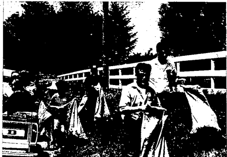
NAPIER AND SHELDON roads in Plymouth Township were scoured for litter by members of the Western Wayne County Conservation Assn., their wives and children.

DON LOR'S COLORLAND TV 33666 W. 5 MILE ROAD 3 blocks West of Farmington Rd.