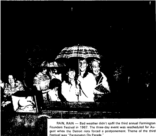
RAIN, RAIN — Bad weather didn't spoil the third annual Farmington Founders Festival in 1967. The three-day event was rescheduled for August when the Detroit riots forced a postponement. Theme of the third Festival was "Farmington On Parade."