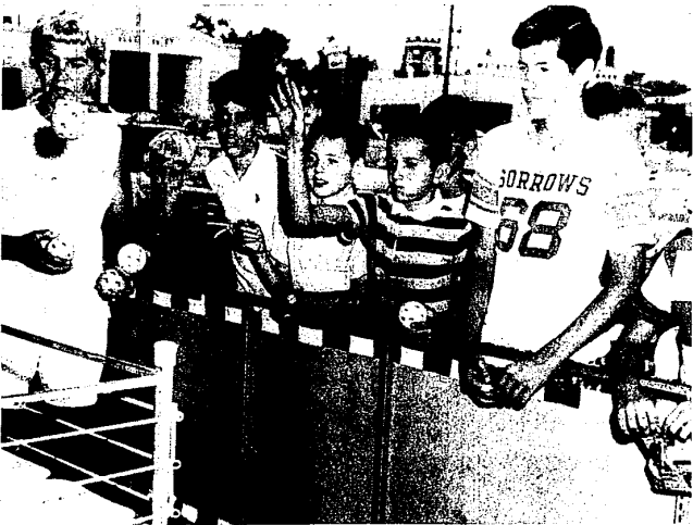
STEEL NERVES — This contestant didn't even flinch in 1968 while testing his skill at one of the many concessions which will be open throughout Farmington on all three days of the Festival.