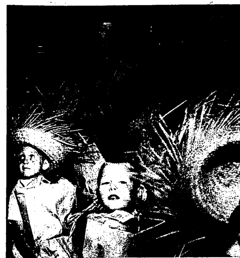
KIDS LOVE to wear hats and these children are no exception. Hats are just one of many items which can be purchased at the sidewalk sales staged by merchants throughout Farmington.