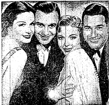
"Artists and Models" begins a three day engagement at the Norwest Theatre. Sunday, Nov. 28 Jack Benny is featured in his hilarious comedy.