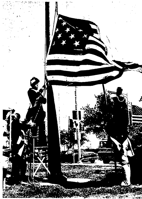
OLD GLORY'S 175TH YEAR — The first raising of the American flag over Detroit and what is now Michigan on July 11, 1796 was re-enacted in colorful ceremonies at the City-County Building. The raising of the 15-star banner honored General Anthony Wayne whose military victories broke the British hold on Detroit and much of the Midwest. The event marked the 175th anniversary of Wayne County which, in 1796, covered all of what is now Michigan, plus parts of four other states.