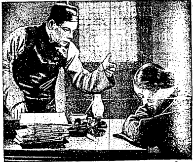
Paul Muni and Luise Rainer in "The Good Earth"