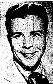
Dick Powell sings the hit songs in "Varsity Show" coming to the Redford Theater Sunday.