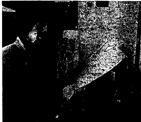
MIKE VITTI displays a copy of the six-act play he wrote to help raise funds for SHAR-house.