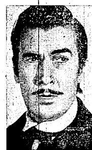
Two of the stars of "Dark Command," Walter Pidgeon and Claire Trevor are shown above. The picture will be shown Sunday and Monday at the Civic Theatre.