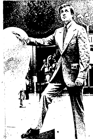
KNIT SUITS FOR MEN are big in the fashion picture.

pants, a striped shirt and a wide belt over a sweater vest. Men all over this area