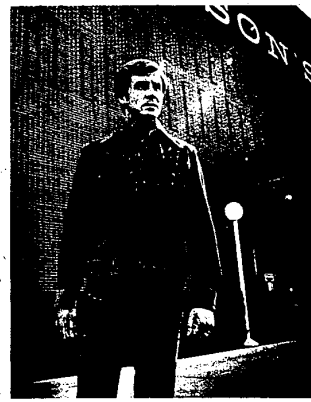
DENIM-LOOK CORDUROY fashions the casual "Saturday suit."