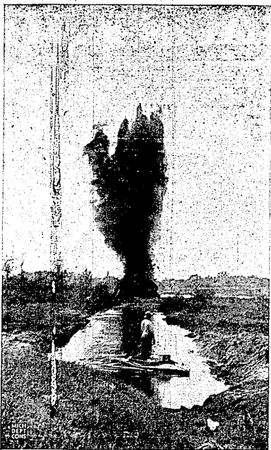
Tossed 200 feet into the air by a charge of dynamite are tons of swampland and floating bog that barred the last stretch of a boat channel dug with explosives from open water through 600 feet of marsh to solid ground at the public fishing site on the shore of Big Crooked Lake, in Livingston County. Ordinary excavating methods could not be used because of mucky character of the shore. The site is one of many the conservation department is buying and improving with fishing license funds to assure public access to good fishing waters.