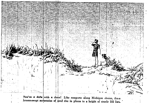
You've a date with a dune! Like ramparts along Michigan shores, these breeze-swept mountains of sand rise in places to a height of nearly 500 feet.