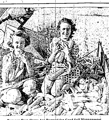
Bumper Crop Crops Are Reward for Good Soil Management.

CHICAGO. — Teamwork between science and industry was cited as the reason why farmers pay less for fertilizer than for practically any other commodity they purchase.