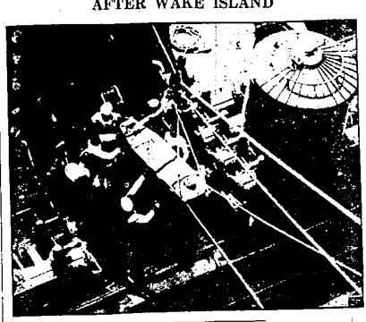
This U.S. Navy photo shows one of the wounded men being transferred from a destroyer to an aircraft carrier following the attack on Wake Island, February 24th, 1942.

Officials estimate that 10,000,000 bicycles are in use in the United States today, a ratio of about one bicycle to every three cars. The 1940 production is estimated at 1,325,000 and this year the production probably will show a sizable increase, they said.