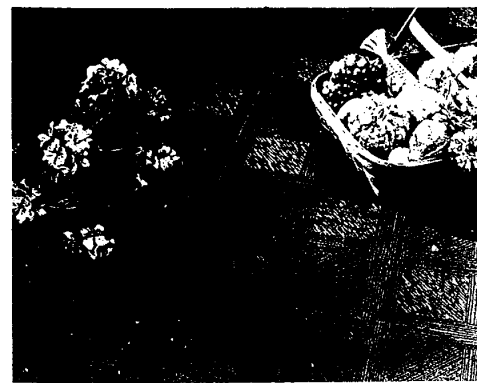
THE CHARM AND WARMTH of Early American inlaid wood floors is recaptured in this wood parquet design called Stockbridge. The Armstrong Cork Company's design is available in five colors and fits any decor where wood floors are desirable.